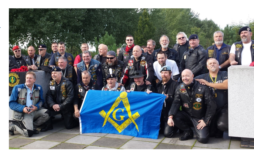
"Freemasonry is so much more than a hobby, it's a way of life. Its core values guide me daily." ROWAN ASHLEY HILL LODGE

Freemasonry provides a structure for members to come together under these common goals, enabling people to make new friendships, develop themselves and make valuable contributions to charitable causes.